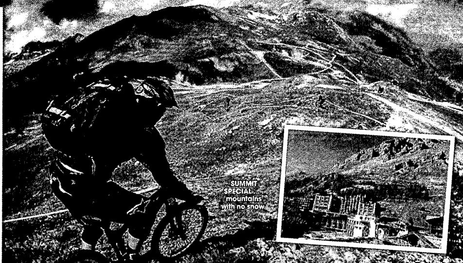
SUMMIT SPECIAL: mountain with no snow

Reward yourself with a trip in the evening to the